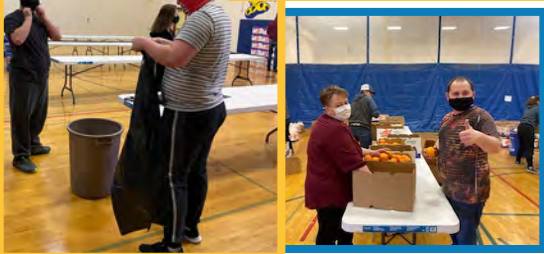
Grade 12 Fruit Sale