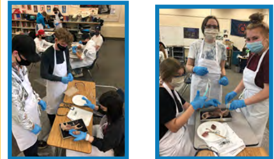
Grade 11 Bio 20