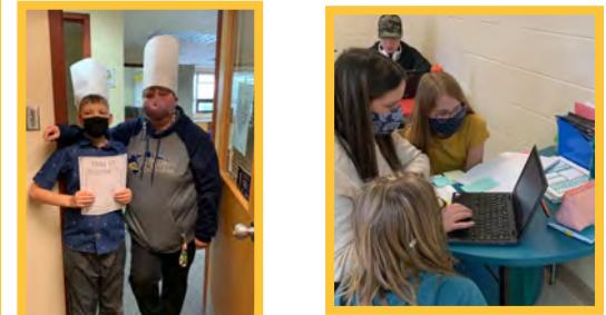
Grade 6/7 Writing