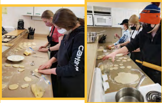
Grade 9 Foods